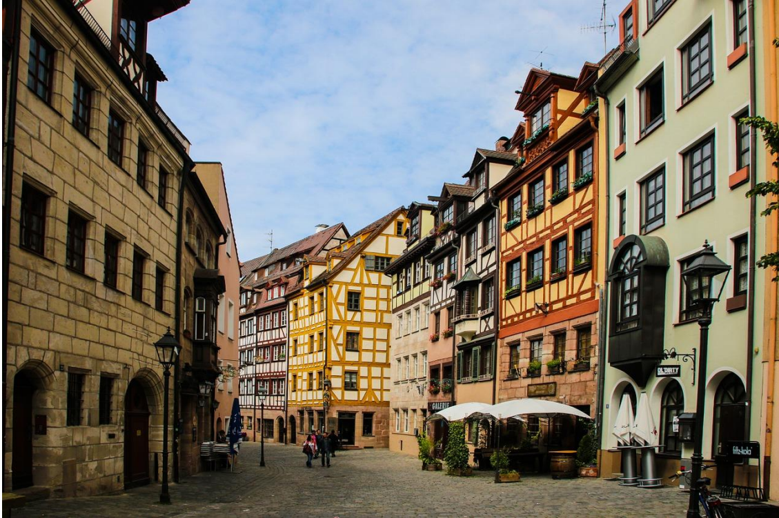
Cobbled street in Nuremberg, Germany

Subsequently there was a programme of continual improvement of the city centre public space. The actual traffic reduction transpired to be double what was expected.